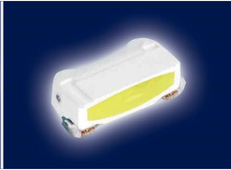
Micro SIDELED® 0.8 mm.