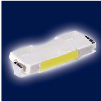
Micro SIDELED® 0.6 mm.